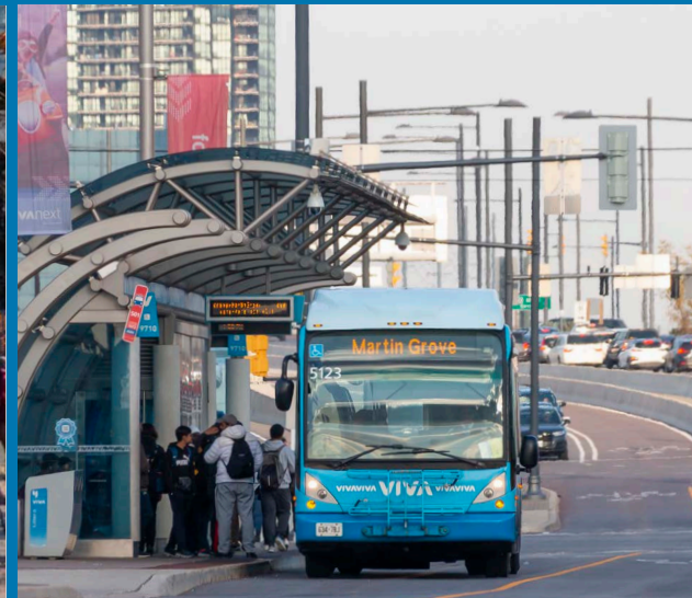
Pictured left: Traffic congestion on Jane Street at Major Mackenzie Drive Pictured right: Viva bus driving westbound on Highway 7 in Vaughan.