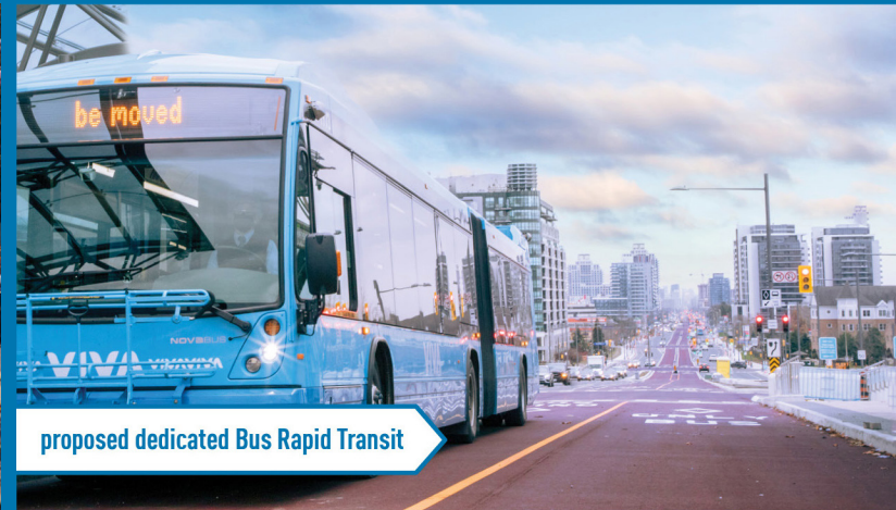
proposed dedicated Bus Rapid Transit